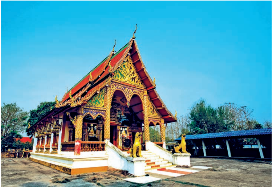
Wat Phrachao Thongthip

with him important Buddha images of Chiang Mai; such as, Phra Kaeo Morakot, Phra Phutthasihing, Phra Setangkhamani or Phra Kaeo Khao, and many others. However, all the images were later returned to Thailand. Phrachao Thongthip was left in the forest for centuries. This 120 cm. high image in the posture of subduing Mara has a lap width of 80 cm. and is famous for its sacredness that someone who wishes to have a child can pray here.