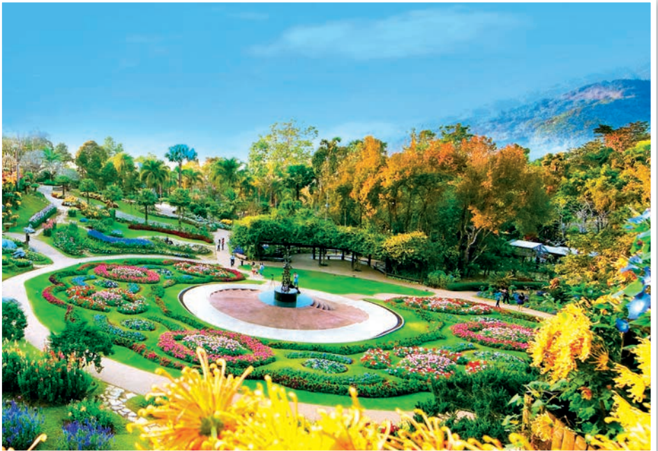
Suan Mae Fa Luang

was initially called "Ban Hin Taek". It is located 66 km. from the town of Chiang Rai. In 1968, Khun Sa as the leader of the Army of the Tai Nation used the area as his stronghold. The word "Khun" was commonly used by the people of Shan State to refer to a person of their respect, but the world knew him by the name of "King of Heroin". During 1976 to 1982, Khun Sa used Ban Hin Taek as his permanent stronghold and did illegal business. Finally, the Thai government forced them out of the Thai territory. At present, the remains of the past can be seen; such as, the house that was used by Khun Sa as the command centre. In addition, Ban Thoet Thai is home to communities of many ethnic groups of hilltribe people who can be seen in the morning market.