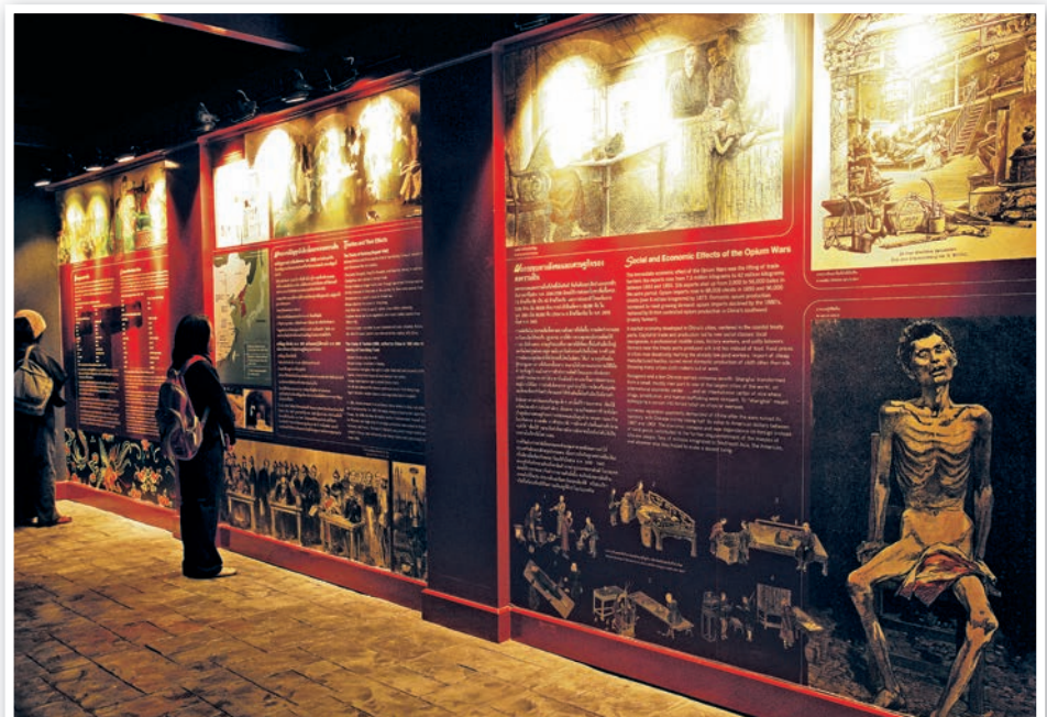
House of Opium