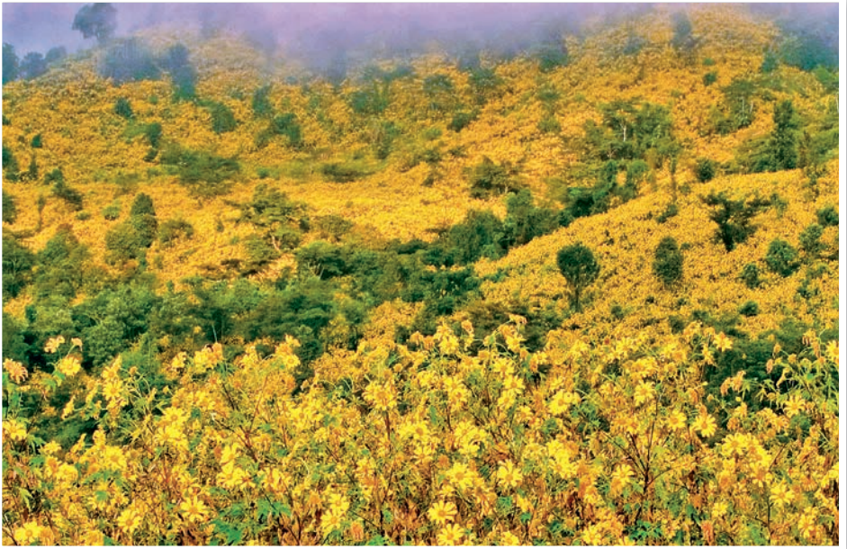
Doi Hua Mae Kham

Doi Tung - Ban Pha Mi Road, around 4 km. from the Wat Noi Doi Tung Junction. Here is the highest viewpoint of Doi Tung. The Chang Mup Stupa is a small pagoda on a large rock that looks like a prostrating elephant. There are surrounding pine trees and giant banyan trees which are grown to preserve the soil and watershed. Visitors can see Kulap Phan Pi (rhododendron) from different continents inside the arboretum. Admission is 50 Baht.