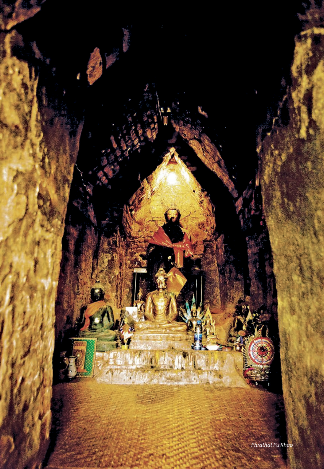
Phrathat Pu Khao