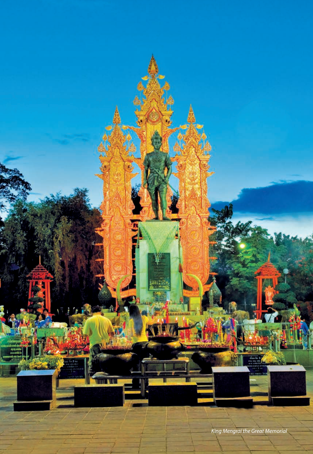
King Mengrai the Great Memorial