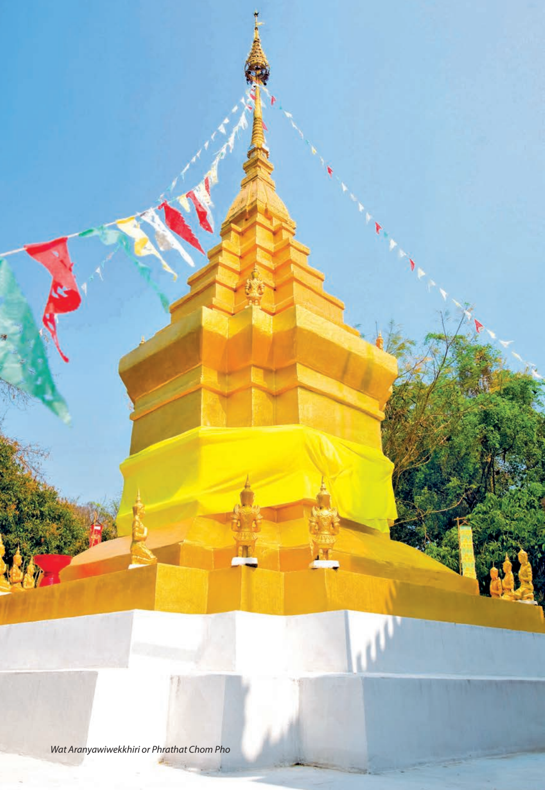
Wat Aranyawiwekkhiri or Phrathat Chom Pho