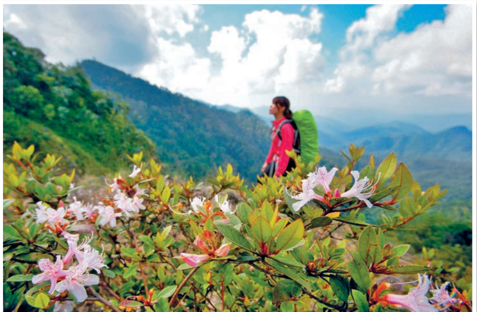
Doi Luang National Park

is located in Mu 2, Tambon Mueang Phan, on Chom Wae (old) Road. The people of Amphoe Phan and nearby districts worship this sacred pagoda. A fair is held every year on the full moon day in the ninth lunar month to pay homage to the pagoda. It has been believed that someone who pays homage and prays will succeed in making a business deal. For further details, contact Tel: 0 5372 1821.