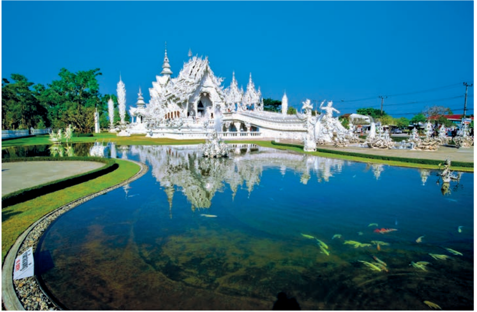
Wat Rong Khun