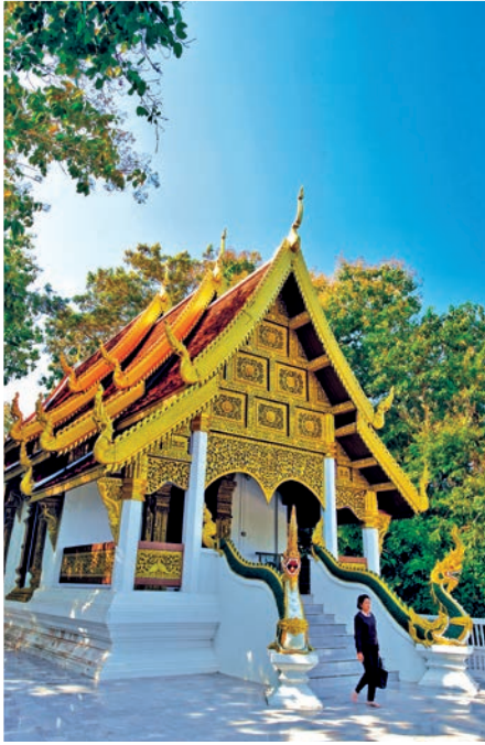
Wat Phrathat Chom Chaeng

in the forest in Ban Mai Phatthana. Every year there is the Wawi Tea Sampling Festival in December.