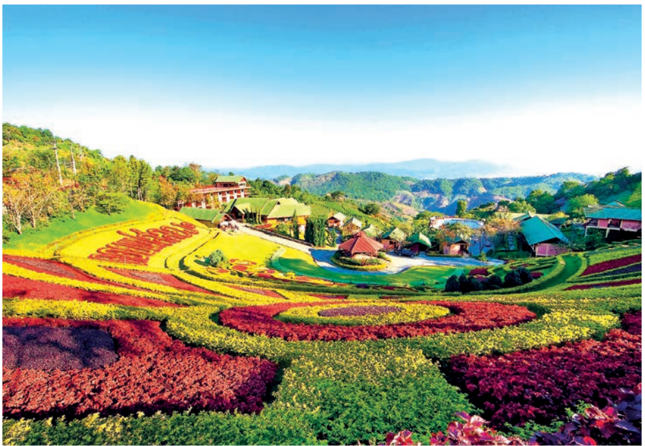
Doi Mae Salong