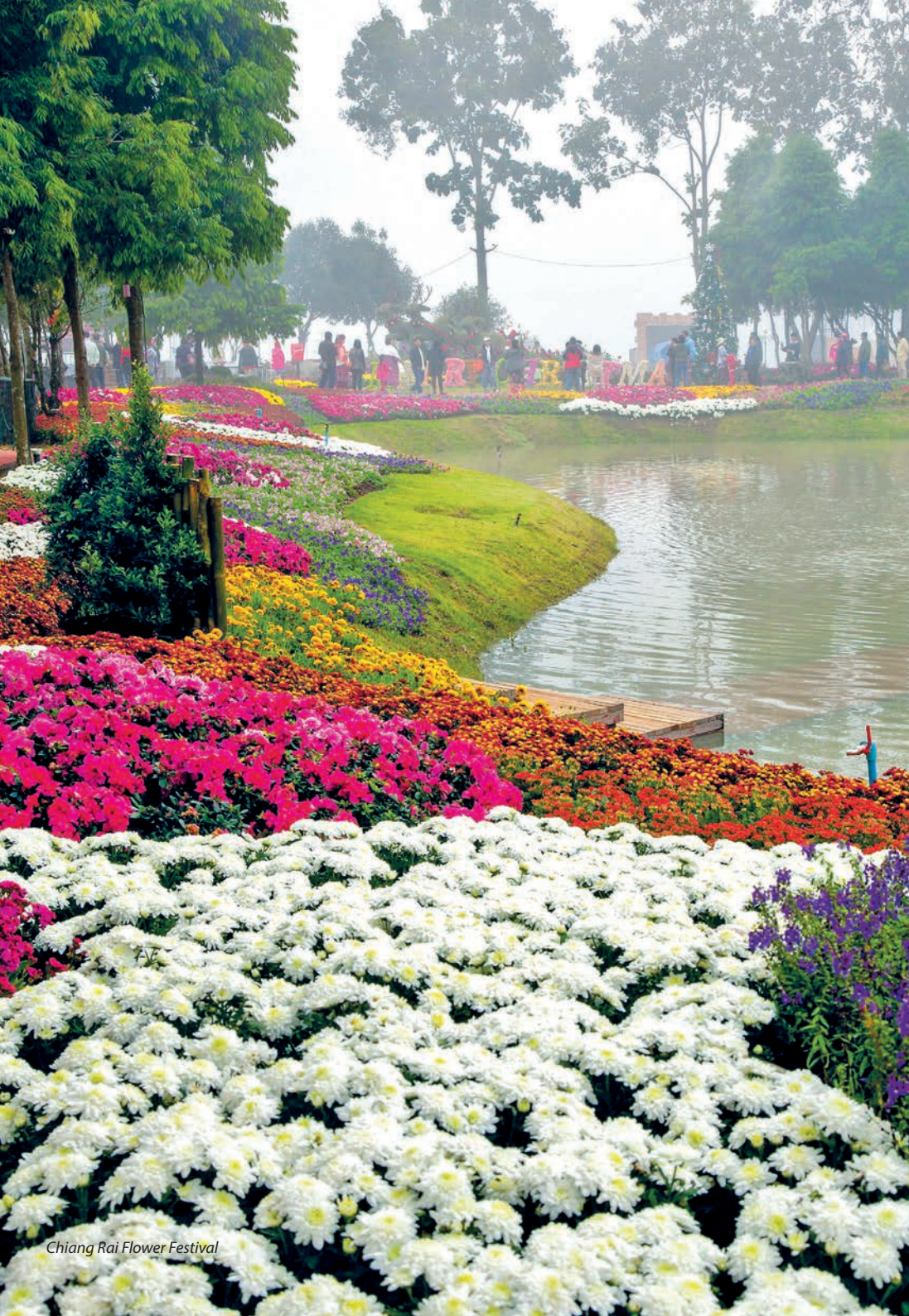
Chiang Rai Flower Festival