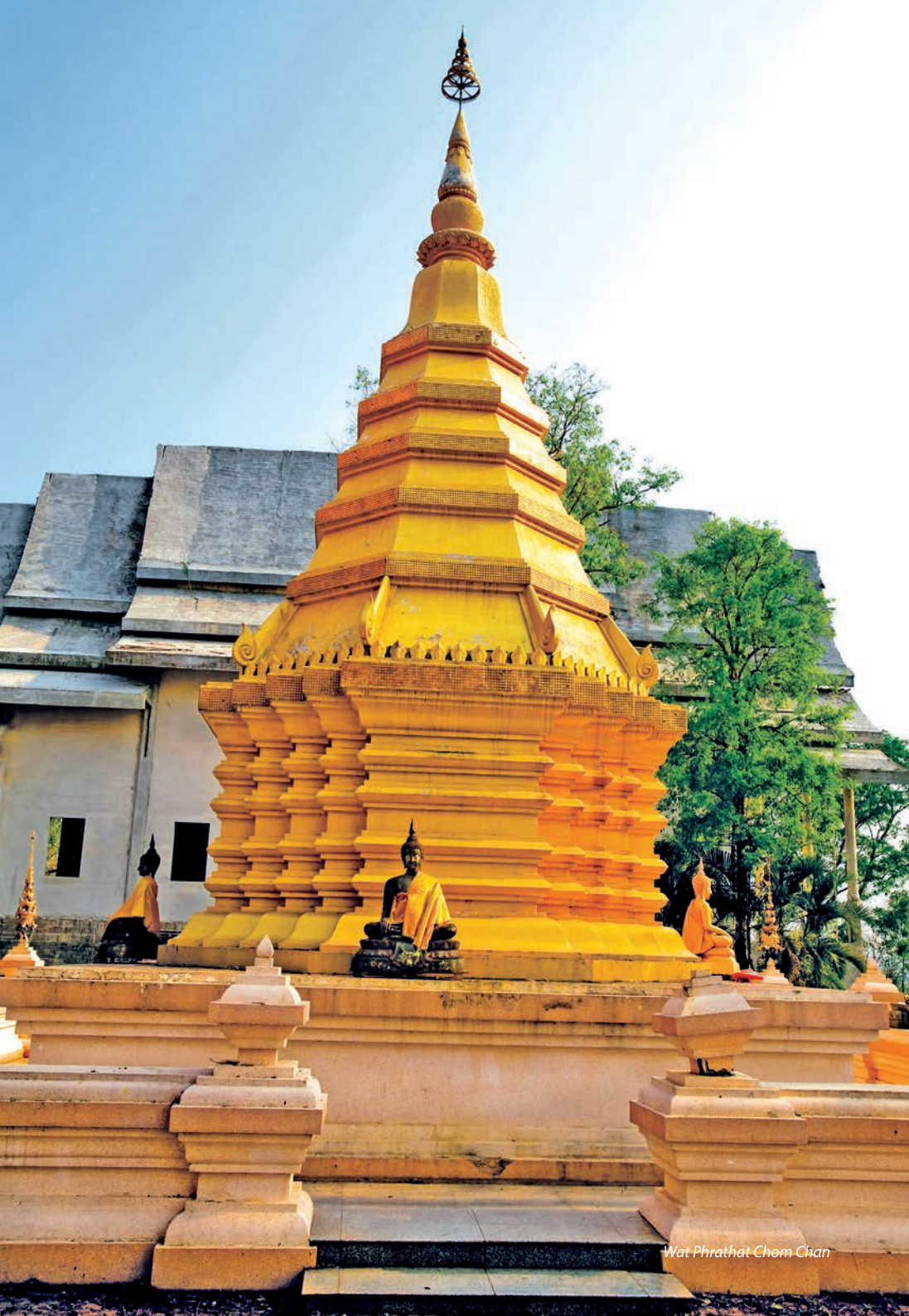
Wat Phrathat Chom Chan