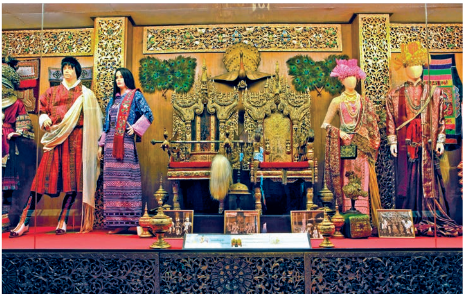
Oub Kham Museum

To get there: take Highway No.1211. After 18 km. turn right and proceed for another 11 km. via Highway No. 1208. Or travel along Highway No. 1 (Chiang Rai-Phayao route) for about 15 km., where there is a right turn to proceed 17 km. further before reaching the National Park’s ranger station. Then, a 30-minute hike to the waterfall. The total distance is 1,400 metres. Contact Lam Nam Kok National Park, Tel: 08 0036 5100.