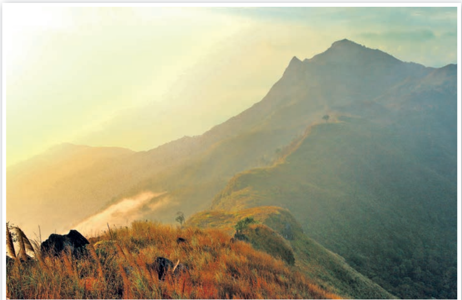
Doi Pha Tang

is situated on the Chiang Saen - Chiang Khong Route along the Mekong River. It is a village of the Thai Lue, a minor ethnic group who has interesting and graceful traditions, and especially their skill on weaving local cloth which is famous. From Amphoe Chiang Khong, visitors can take along-tailed boat ride to Ban