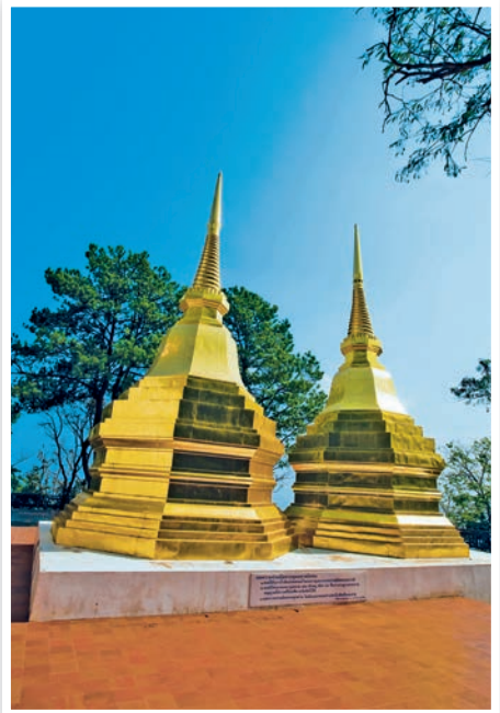
Phrathat Doi Tung

is located at Km. 17.5 on Highway 1149. The Lord Buddha's left collarbone relics brought from Madhya Pradesh, India, have been enshrined here. It was the first time that the Lankavamsa or Theravada Buddhism was founded in Lanna Thai. In the construction of the relic stupa, a one-thousand-wa long