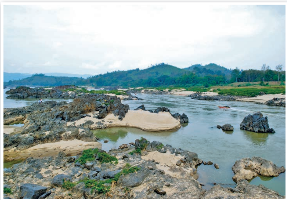
Hat Pha Dai

Hat Bai from the Buck Pier. On a one-hour river trip, visitors will also see nice views along the banks of the Mekong River.