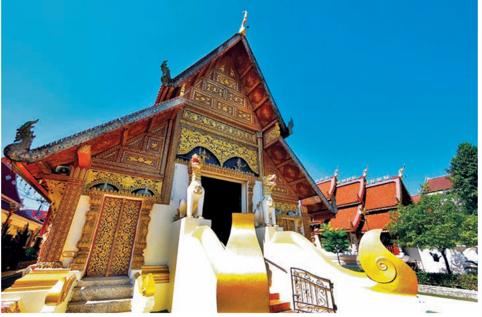
Wat Phra Sing

by an earthquake. When Phaya Mengrai spotted the strategic location on which to establish Mueang Chiang Rai from the top of Doi Chom Thong, a new chedi was constructed there. The 108-post City Pillar known as Sao Sadue Mueang-the City Navel Pillar or centre of the city-is also installed here to commemorate Phaya Mengrai and to celebrate His Majesty King Bhumibol Adulyadej's 6 th cycle birthday anniversary. His Majesty came to anoint the pillar on 27 January, 1988. It is much revered by devotees gathering to pay their respects with a bathing ceremony, Tel: 0 5371 6055.