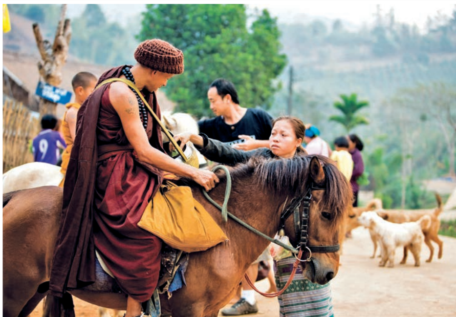
Wat Tham Pa Acha Thong

follow the Den Ha - Dong Mada Road and pass the Ban Nong Phak Hueat Wildlife Breeding and Research Centre before reaching the chedi, a distance of 24 km.