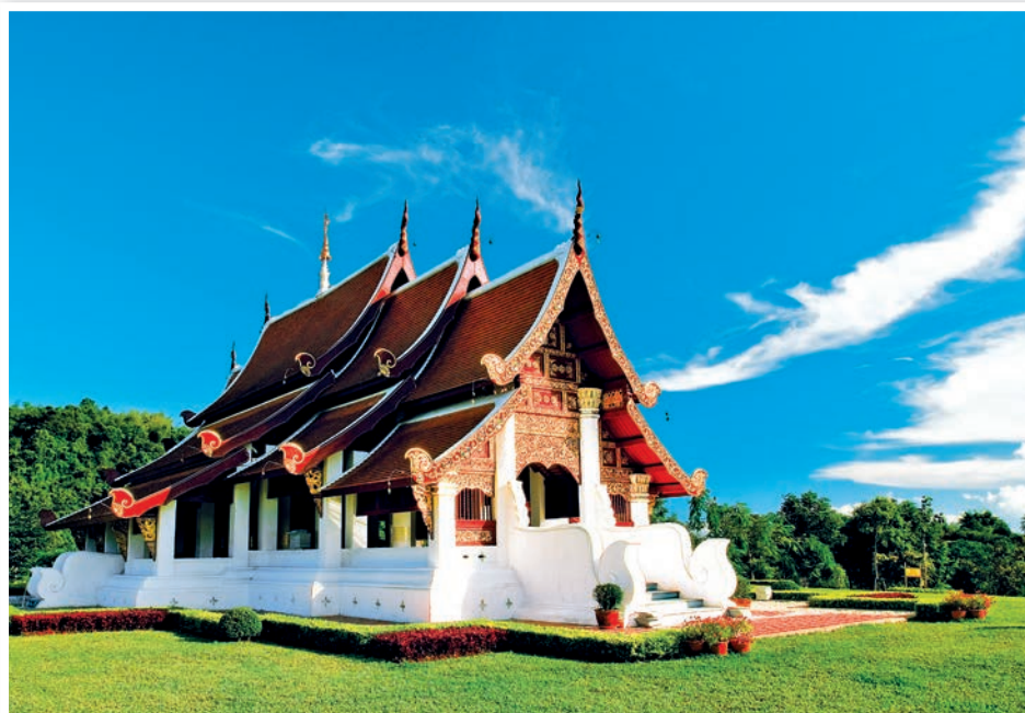
Wat Phra Chao Lan Thong