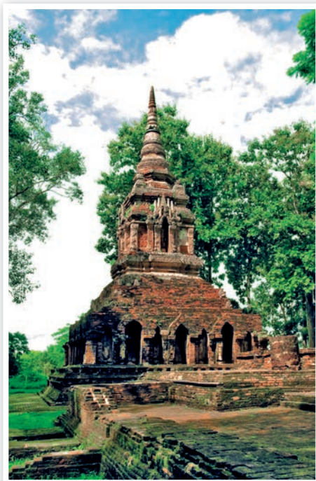
Wat Pa Sak

This temple/Dharma centre is located 4 kilometres from Amphoe Chiang Saen, along the Chiang Saen–Chiang Khong road, opposite Sop Kham School. The current wihan was built over the old ruins. Wat Phrathat Pha Ngao houses a relatively small bell-shaped pagoda on a big boulder. In 1976, a Buddha image Luangpho Pha Ngao presumably 700-1,300 years old was excavated. It is assumed that this was the principal temple of the Yonok Kingdom. This hilltop temple offers a spectacular view and behind it lays Phra Borommthat Phuttha Nimit Chedi. About a kilometre up the hill is the site of another ruined temple Wat Chedi Chet Yot. We can say that Wat Phrathat Pha Ngao and Wat Chedi Chet Yot are on the same hill. Its spacious and serene compound is ideal for practicing meditation. The 2-storey wooden Lanna Chiang Saen Textiles Museum is in front of Wat Phrathat Pha Ngao. The spacious common area downstairs serves as a weaving unit for the Ban Sop Kham housewives groups. Upstairs are displays of antique fabrics and