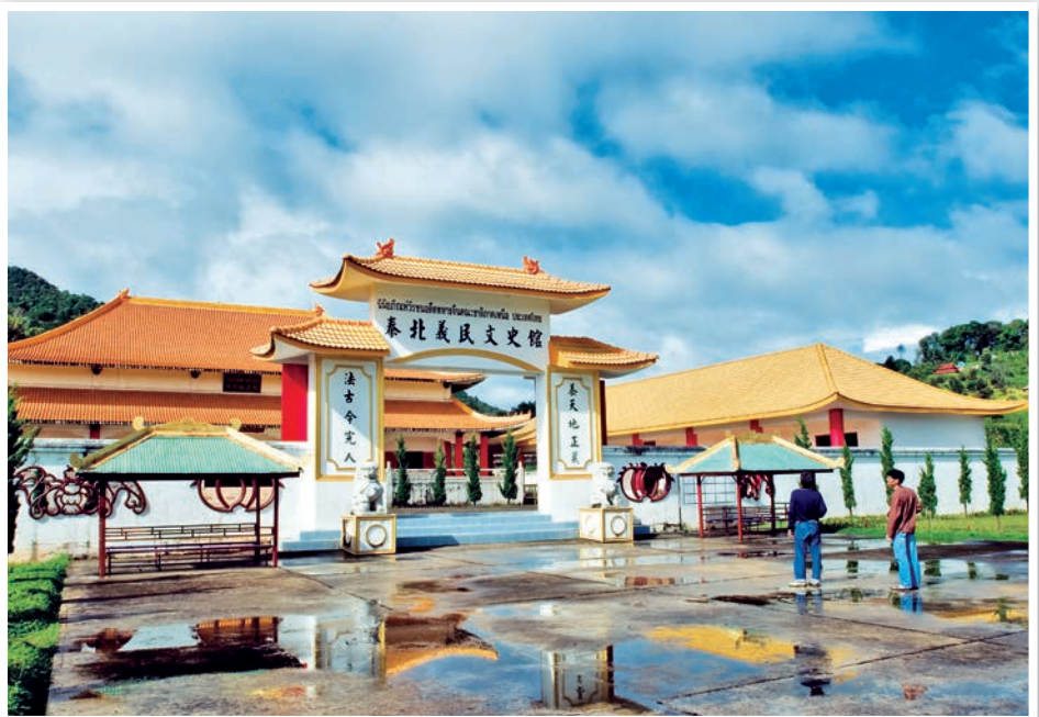
Chinese Martyrs' Memorial Museum

Built to commemorate the 93 rd Division of the anti-communist Kuomintang (KMT), who in 1971 assisted the Thai Government combat operation against Communist insurgents in Doi Luang, Doi Yao, and Doi Pha Mon of Chiang Rai Province, as well as, in Khao Ya of Phetchabun Province in 1981. A number of these soldiers were killed, wounded, and crippled. The Museum exhibits the history of their struggle and settlements, along with the development of the Mae Salong community. Visitors will also enjoy the library's