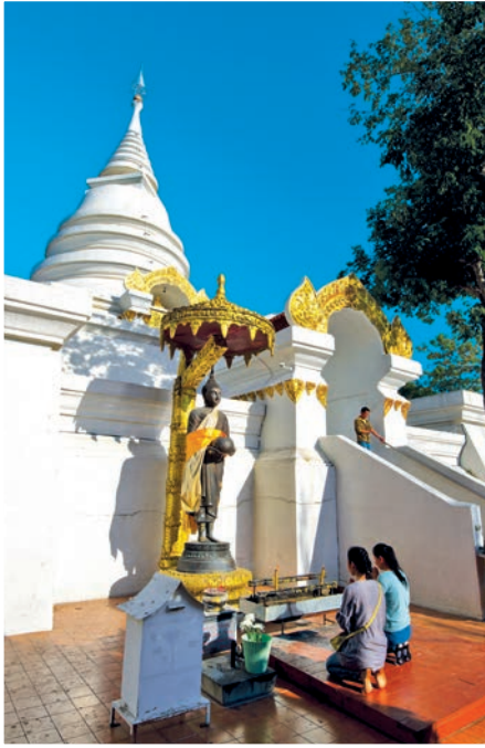
Wat Phrathat Pha Ngao

immigrate to the site during winter. Located 5 kilometres from the district on Highway no.1016, the Chiang Saen-Mae Chan route, then turn left at km.26 proceed on for another 2 kilometres to reach the site. For more information Tel: 08 1764 4990